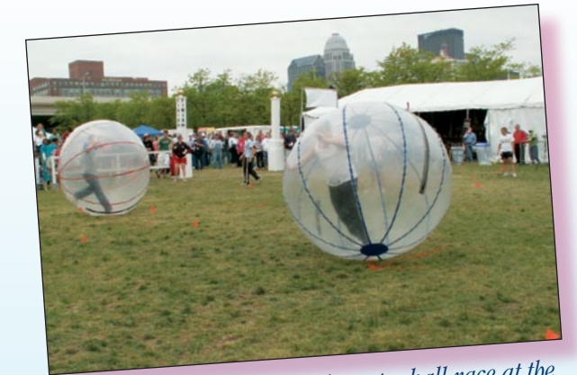
Participants compete in the hamster ball race at the 2008 Corporate Battle of the Bounce