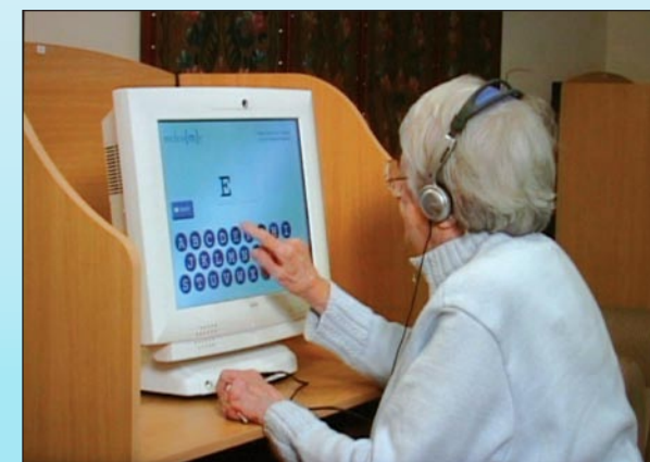
A resident at the Louisville campus gets a mental workout at the Brain Gym