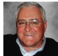
Frank Farris Governance Leadership Award LeadingAge Kentucky Christian Care Communities Board Member