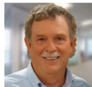
Bill Collins Outstanding Administrator Award LeadingAge Kentucky Christian Health Center Corbin