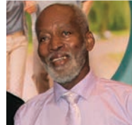
John Rodgers Supportive Services Award LeadingAge Kentucky Christian Health Center Louisville